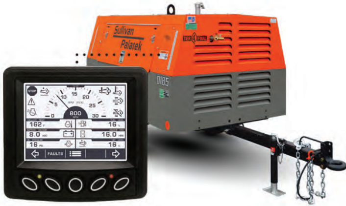
Sullivan-Palatek Electronic Controller (SPEC)

Wider wheel base provides improved balance and stability on the highway and job site