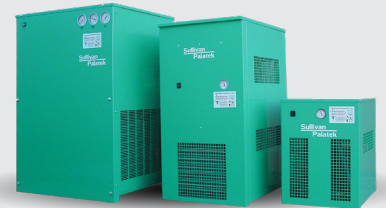
Refrigerated Air Dryers