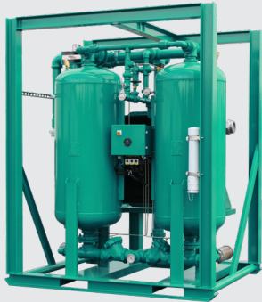
Aftercooler/Dryer Skid Packages