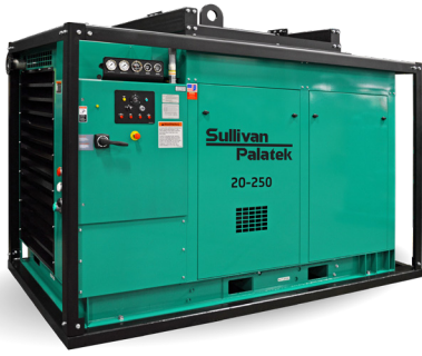
Electric Construction Compressors