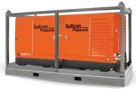
375-1600 CFM Offshore