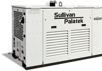
Utilities 110-260 CFM